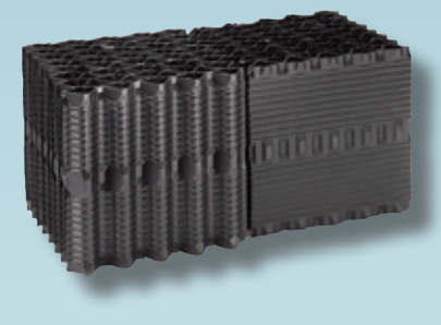
VertiClean™ Non-Fouling Film Fill family