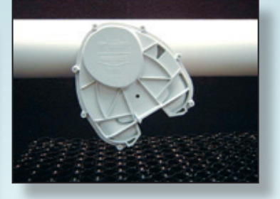
EvapJet™ II Nozzle