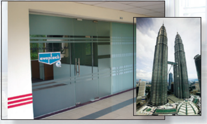
EvapTech, Inc. World Headquarters - Lenexa, Kansas